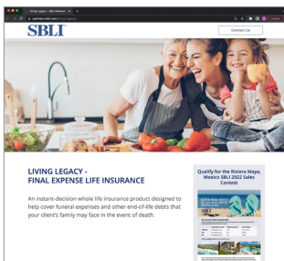
Sales & Marketing Resources Microsite