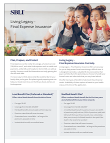
Final Expense Insurance Consumer Brochure