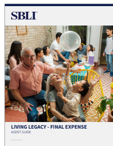
Final Expense Insurance Agent Guide